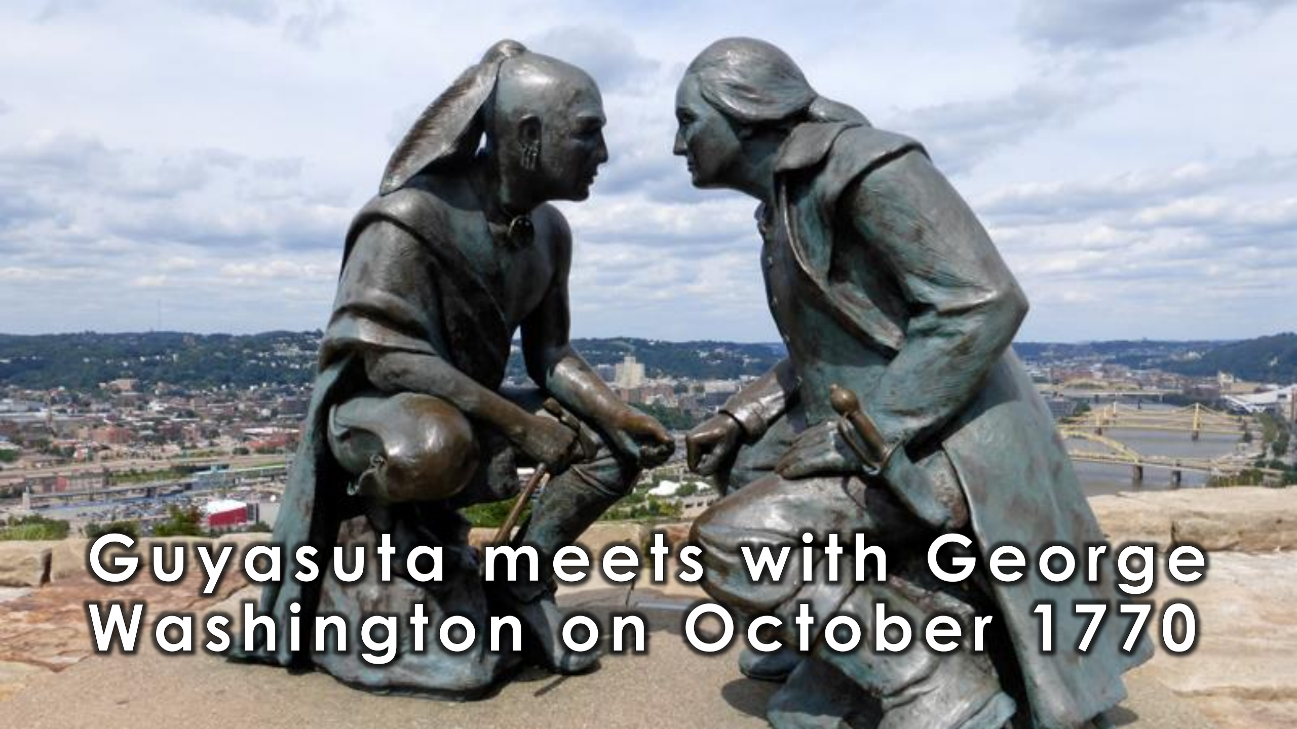
Guyasuta meets with George Washington on October 1770