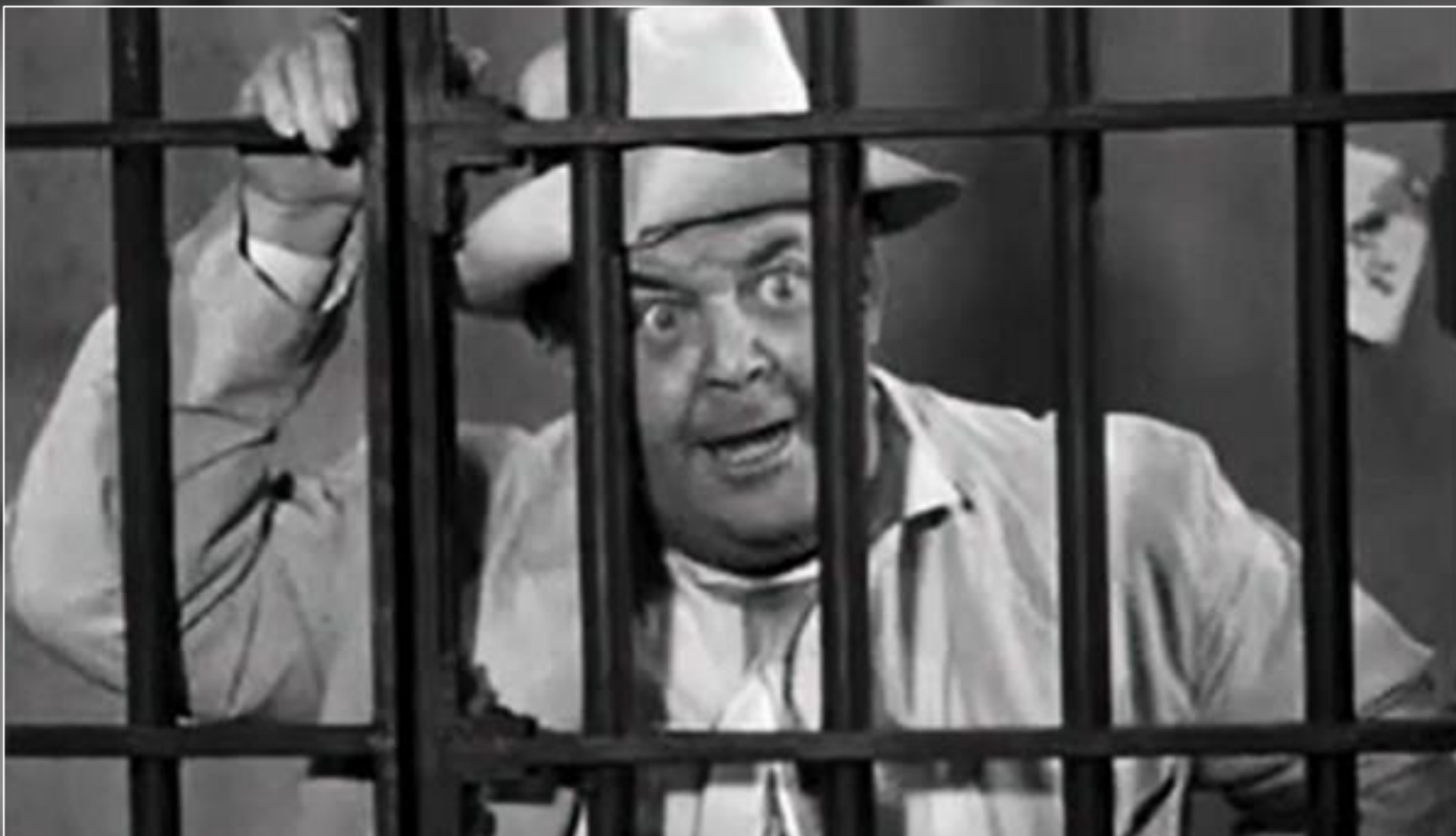
Otis the town drunk